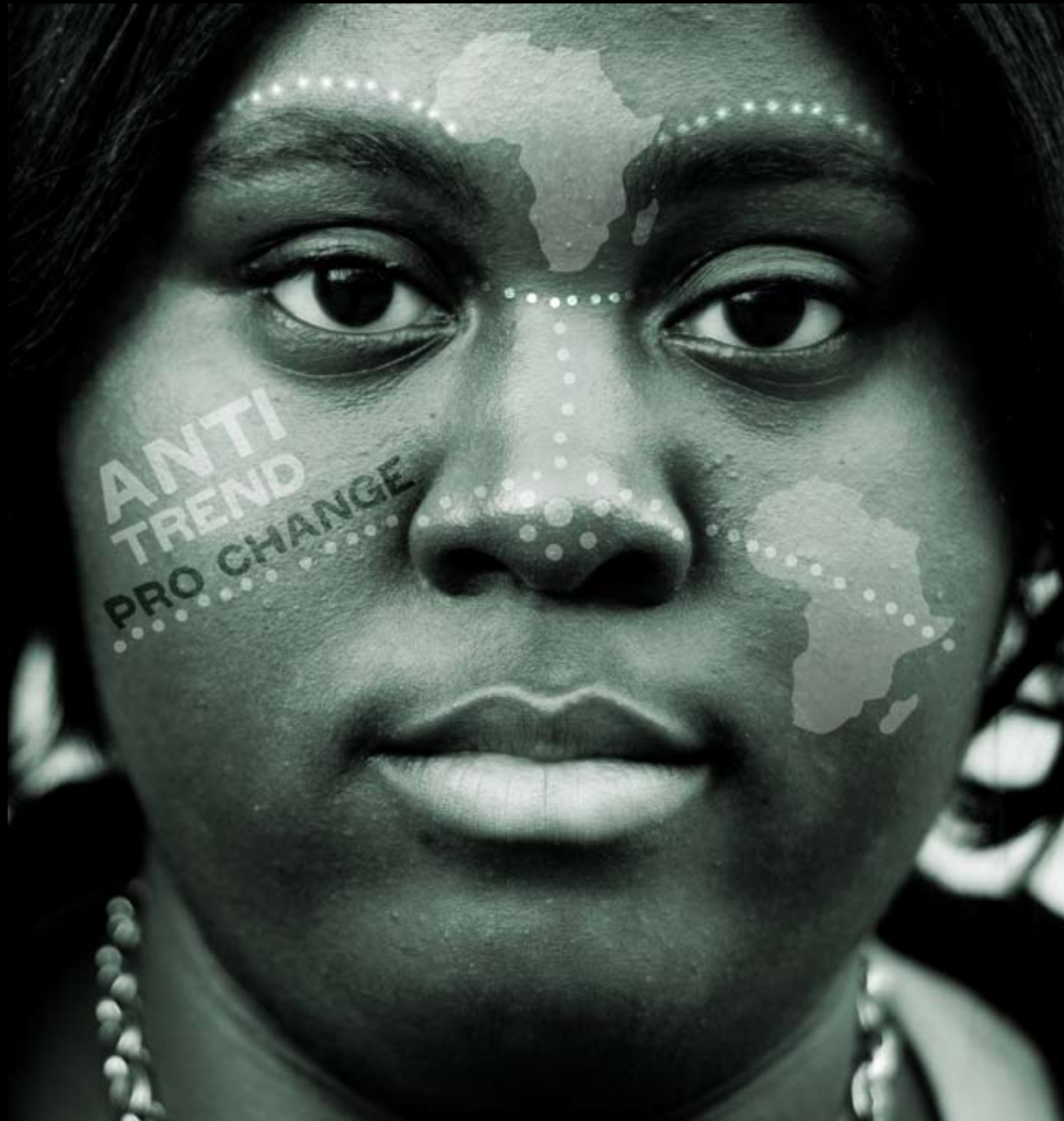
Anti Trend, Pro Change